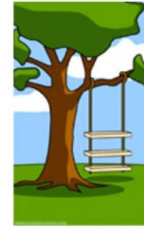
How the customer explained it.