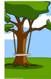
How the project leader understood it.