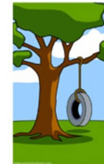
What the customer really wanted.